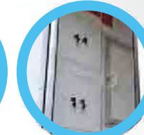
LOCKERS FOR STAFF