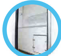
BUILT IN NPU