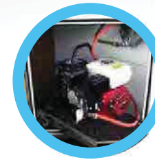
BUILT IN HONDA GENERATOR