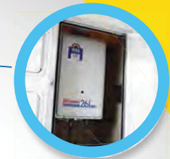
RINNAI GAS WATER HEATER