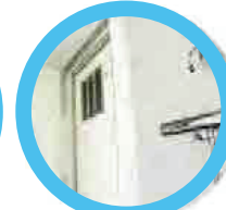
5 STAGE DECON