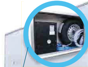
BUILT IN NEGATIVE PRESSURE UNIT