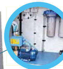
BUILT IN WASTE WATER PUMP SYSTEM