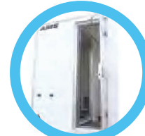
DIRTY END AIRLOCK