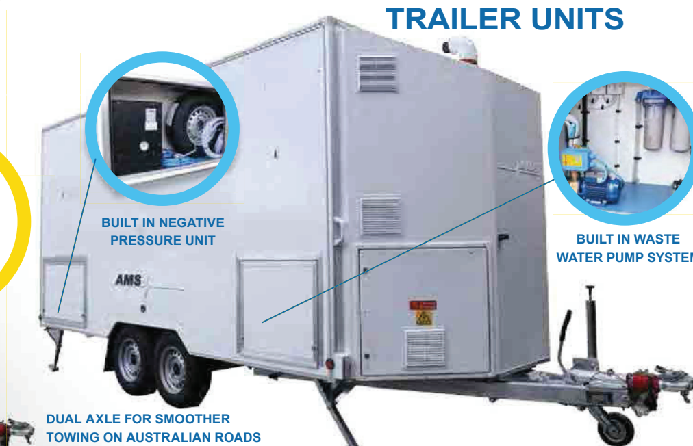
DUAL AXLE FOR SMOOTHER TOWING ON AUSTRALIAN ROADS